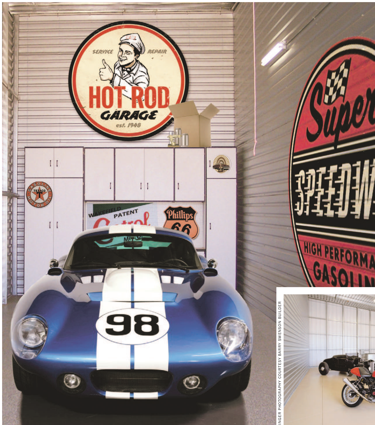
FINGER PHOTOGRAPHY COURTESY BARRY SWENSON BUILDER